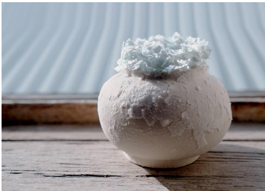
Pei-An Lin: To achieve a closed material cycle, Pei-An works actively with material researchers and local companies

Pei-An Lin researches the effects of global climate change on marine ecosystems and human society. The designer from Taiwan is particularly concerned with the question of how we can regenerate raw materials and live sustainably. With the REEF project, she presents a unique concept: the beauty in the asymmetry of natural objects that become decorative design objects. REEF imitates reefs in the sea - made of a collection of coral polyps held together by calcium carbonate. Fish scales as remnants of aquaculture shape flower-like corals. Depending on the firing temperature, different shades of colour are produced. Pei-An uses local clay and biomineral in its ceramic production to represent the conscious moments of life.