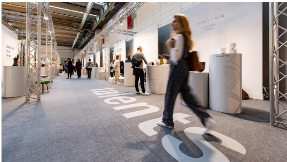
Visitors will find the trend-setting, inspiring creations in the Talents areas – in hall 3.1 (Interior Design) and in hall 12.1 (Tableware & Accessories)