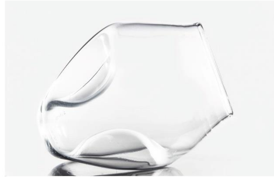
Korppi: Wildwild Twist Bowl (left) / 30s Cognac Glass (right)