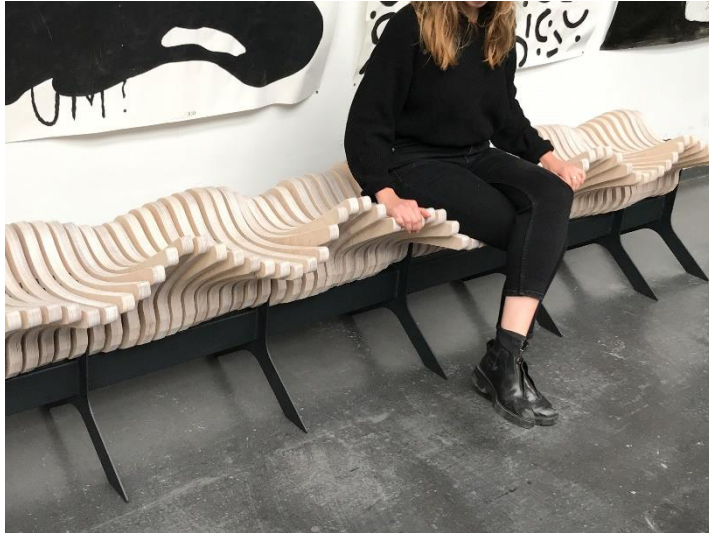
SurfBench: A bench that makes us curious, encourages interaction between people, engages us and teaches us physics through the use of our hands.

Technology and intuition - mechanical and intuitive design: a duality whose interplay awakens emotions and opens the eye to the possibilities of colours, materials, forms and functions. In "The Light Charmer", designer Amy Lewis uses the qualities of combined materials with the help of the Japanese weaving technique Kumihimo. The freedom of hand weaving allows for the creation of truly unique pieces: Through specific selection of colour, texture and composition, materials are transformed into individual design objects. Light is used as a further design element of the art of weaving - and thus brings lightness, clarity and movement into rooms. Amy Lewis' Japanese roots enable her to combine British values with Japanese ones and to tell stories that interweave past, present and future. The contemporary interpretation of traditional textile crafts opens up ways to reuse materials.