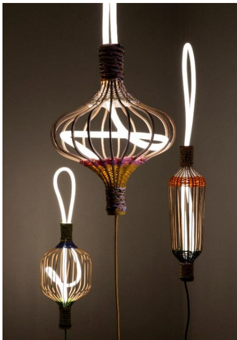
Amy Lewis: The „Light Charmer“ focuses on the interplay of mechanical and intuitive design that can evoke emotions

Technology and intuition - mechanical and intuitive design: a duality whose interplay awakens emotions and opens the eye to the possibilities of colours, materials, forms and functions. In "The Light Charmer", designer Amy Lewis uses the qualities of combined materials with the help of the Japanese weaving technique Kumihimo. The freedom of hand weaving allows for the creation of truly unique pieces: Through specific selection of colour, texture and composition, materials are transformed into individual design objects. Light is used as a further design element of the art of weaving - and thus brings lightness, clarity and movement into rooms. Amy Lewis' Japanese roots enable her to combine British values with Japanese ones and to tell stories that interweave past, present and future. The contemporary interpretation of traditional textile crafts opens up ways to reuse materials.