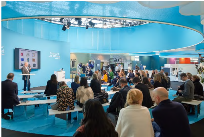
At the Future of Work Academy, top experts shed light on opportunities and solutions relating to the meta topic of New Work.

In the Future of Work Academy in Hall 3.1, B10, everything revolves around the questions of how modern, hybrid working will be organised in the future and which spaces and equipment will be required for this. Every day, there will be a different focus, exciting topics and guided tours on the agenda.